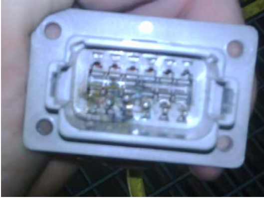
Figure 1: Deutsch Connector with Corrosion