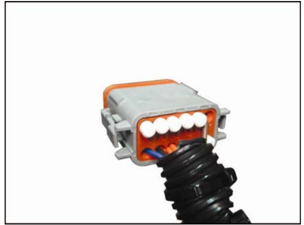
Figure 4: Deutsch Connector with Deutsch Plugs