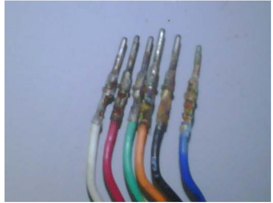
Figure 2: Deutsch Pins with Corrosion