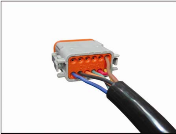
Figure 3: Deutsch Connector without Deutsch Plugs