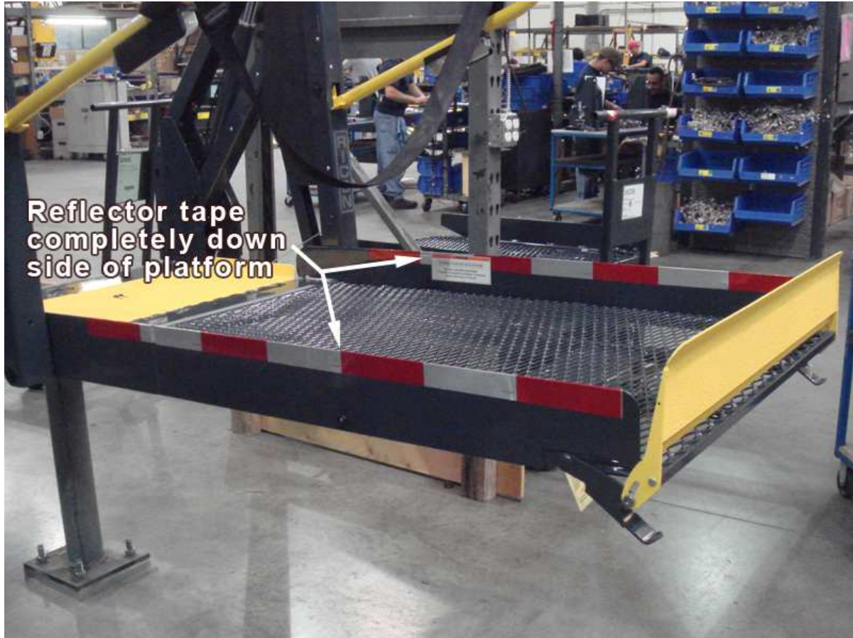
Figure [6] Reflector tape