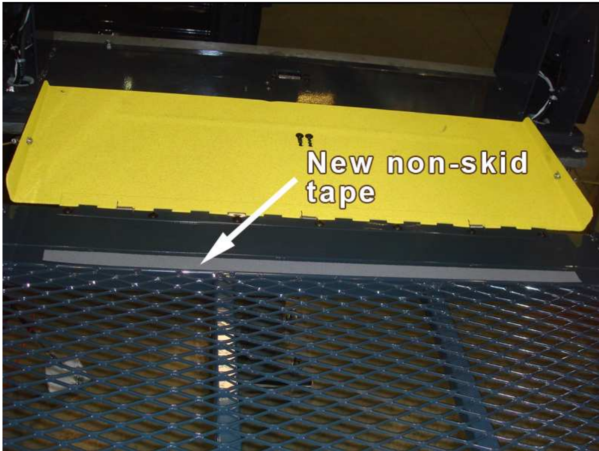
Figure [5] Non-skid tape