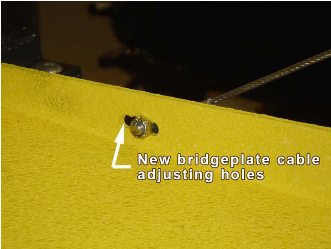
Figure [4] Bridgeplate