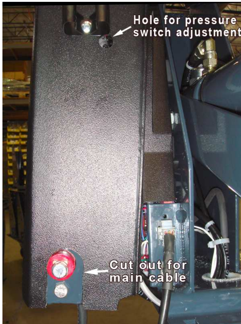
Figure [2] New cutouts in pump cover