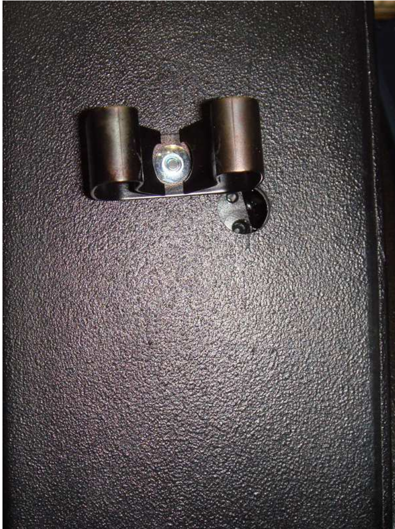
Figure [3] Pressure switch