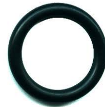
BLACK O-RING PART # 13008