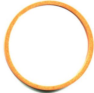
ORANGE PISTON RING SEAL PART # 13006