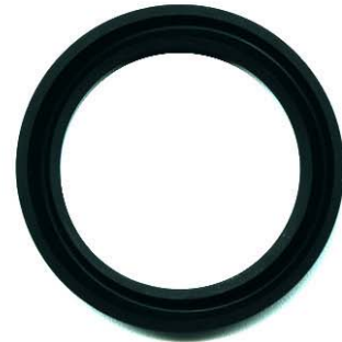
BLACK U-CUP SEAL PART # 13007