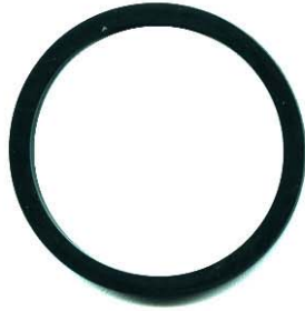
BLACK SQUARE EXPANDER SEAL PART # 13017