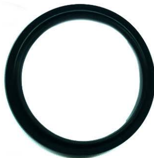
BLACK WIPER PART # 13011