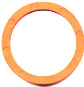
THIN ORANGE BACK-UP RING PART # 13005