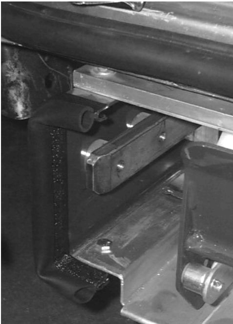
FIGURE [1]: INSTALL WEATHERSTRIPPING ON BOTH SIDES OF LIFT BRACKET

NOTE: Installation of these panels prevents use of the factory jack. A jack with a minimum lifting capacity of 2 tons, and capable of lifting 9 inches, can replace the original jack.