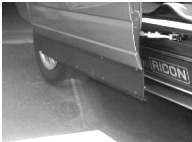
FIGURE [4]: INSTALL SLIDING DOOR PANEL