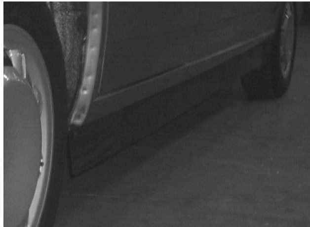
FIGURE [2]: INSTALL DRIVER SIDE PANEL