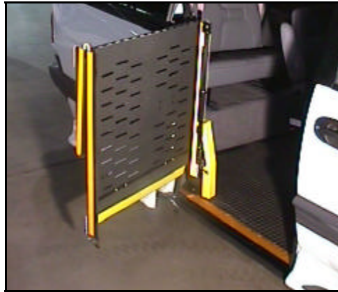
FIGURE [1-5]: RAMP PIVOTED OUT