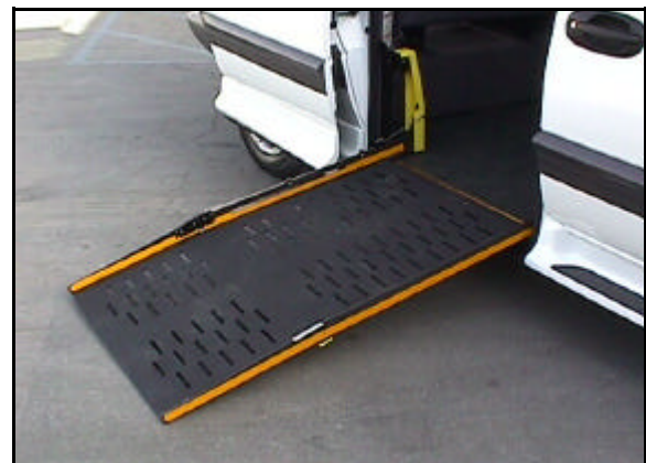
FIGURE [1-4]: RAMP DEPLOYED