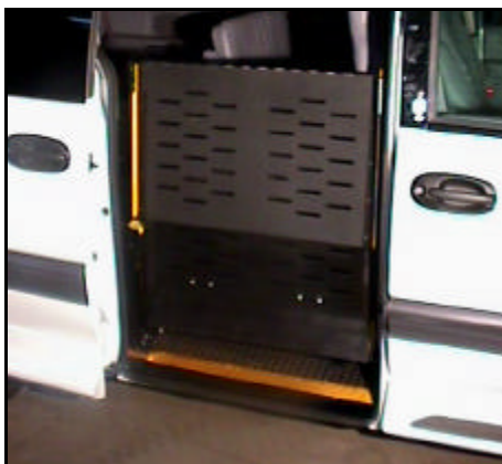
FIGURE [1-3]: RAMP STOWED

The folding ramp provides wheelchair access to vehicle. During driving and when it is not being used, it is stored in a folded position inside vehicle. This is referred to as stowed position as shown in Figure [1-3] . To use ramp, it is unfolded or deployed as in Figure [1-4] . The ramp can be swung outward, as shown in Figure [1-5] to enter vehicle without deploying ramp.