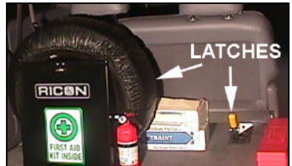
FIGURE [1-6]: REAR SEAT LATCHES

By unlocking right and left latches, the rear seat of vehicle can be removed temporarily. The right latch is seen in Figure [1-6] and left latch is behind spare tire.