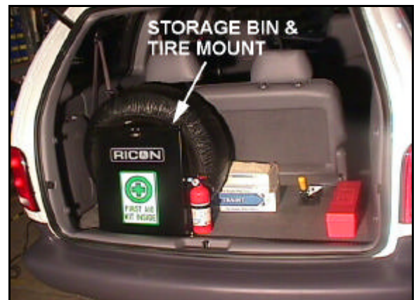
FIGURE [1-7]: VEHICLE CARGO AREA

The Q'Strain® Wheelchair & Occupant Restraint System, triangle flare kit, fire extinguisher, and first aid kit are supplement items provided for the ACTIVAN TX . The Q'Strain® System is used to secure or tie-down wheelchairs during vehicle operation. The triangle flare kit is used to notify traffic if vehicle is not driveable while on a road. The fire extinguisher is mounted to right side of storage bin and first aid kit is located inside bin. All items are reached through rear hatch.