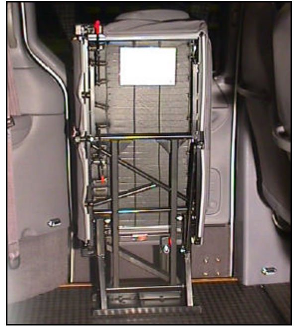
FIGURE [1-9]: MIDDLE SEAT UP