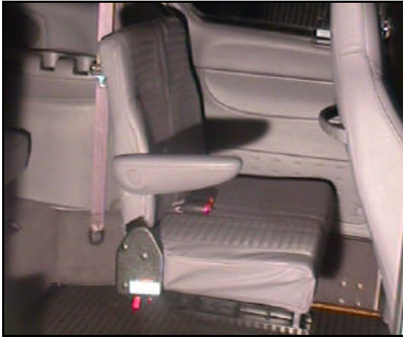
FIGURE [1-8]: MIDDLE SEAT DOWN

The optional foldaway middle seat can be raised to accommodate a secured wheelchair in vehicle. Figure [1-8] shows seat in its normal down position and Figure [1-9] shows entire seat in up or stored position.