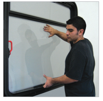
OPTIONAL GLASS GUARD WINDOW LINERS PROVIDE FOR CONVENIENT LINER REPLACEMENT IN LESS THAN 60 SECONDS.